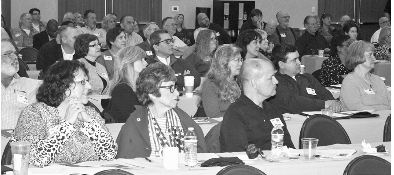
THE CROWD OF OFFICIALS at the Naperville education district meeting

TOI Associate Director / Education Coordinator