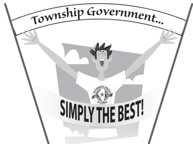
Annual Educational Conference 2010

"closer to home." The three-day Annual Educational Conference is held in November and includes the opportunities to network and attend a variety of educational sessions. November 7-9 will be this year's Conference at the Prairie Capital Convention Center in downtown Springfield. You won't want to miss the opportunity to come together with township officials from all over the state to better educate yourself and help us celebrate "Township Government - SIMPLY THE BEST".