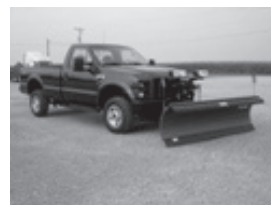
WESTERN RUGBY CRYTEEL

Serving Central Illinois for more than 15 years