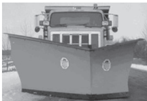
ROOT EAGLELIFT PSE-CODE 3 WARNER

The remaining five (5) educational districts will provide educational programs for township officials. Each program is unique with varying topics. The counties served by each district are shown on the next page: