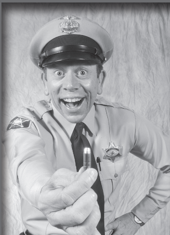
THE MAYBERRY DEPUTY

Tickets for the banquet are $45 each and may be purchased when sending in your advance Conference registration. In order to meet facility guarantees, tickets must be ordered by October 21st.