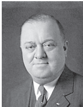
TOI FOUNDER Rufus Kendall, circa 1940

TOI also has a presence on the World Wide Web. Our web site is found at www.toi.org . I encourage you to visit TOI's web site and access the tremendous amount of information there, including division pages for all of TOI's divisions, plus useful forms you can download and print for your use. On-line transactions are also available to purchase any of TOI's publications.